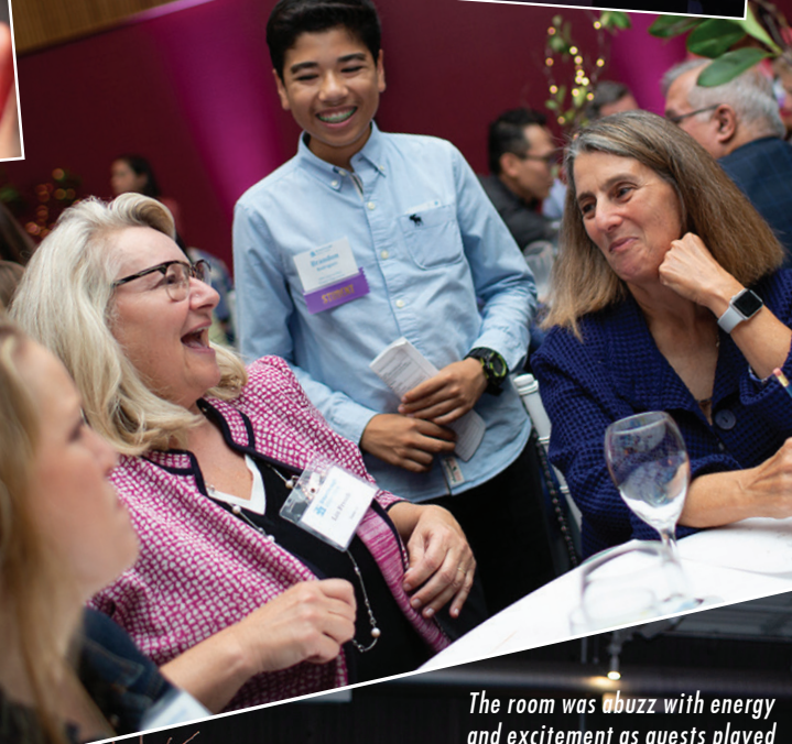
The room was abuzz with energy and excitement as guests played riveting rounds of trivia.